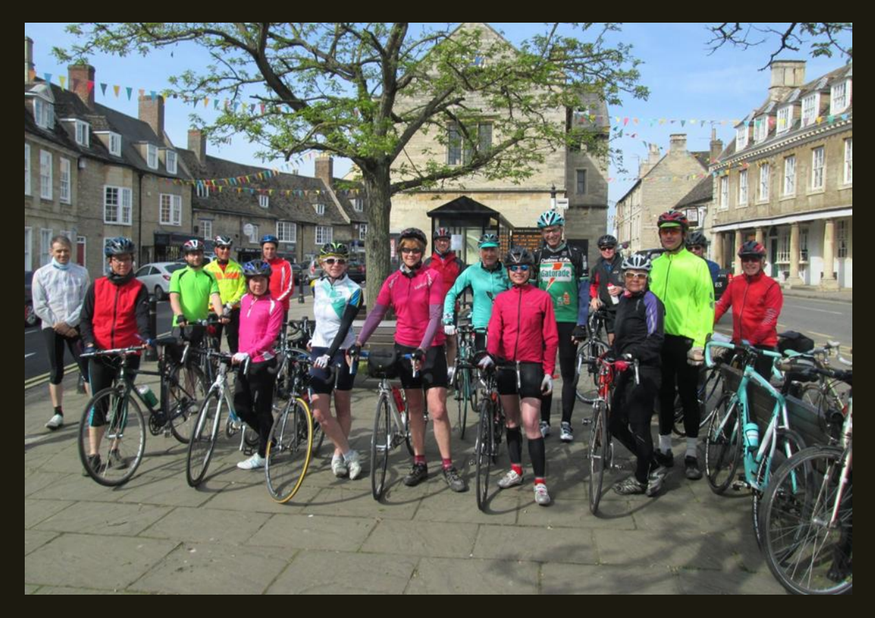
CTC Northampton lead a ride following Stage one of the Women Tour Route from Oundle to Northampton in 2014.