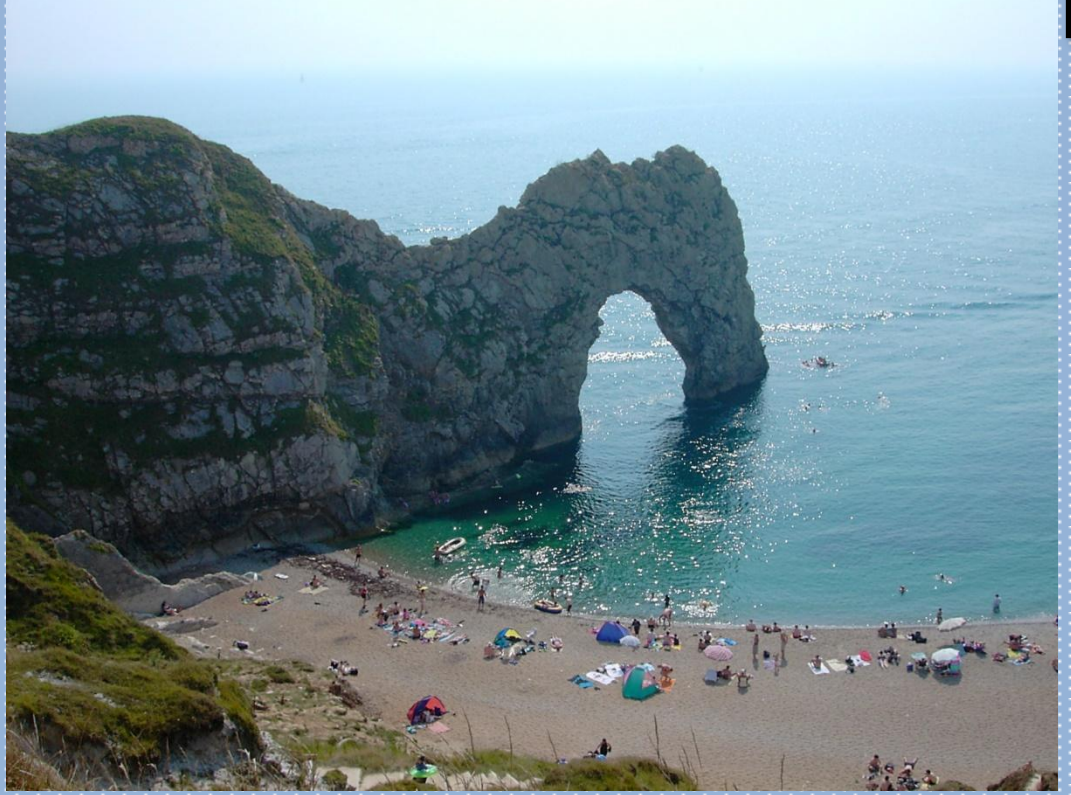
The CTC is 125 years old. To celebrate we threw a party down Dorset way.