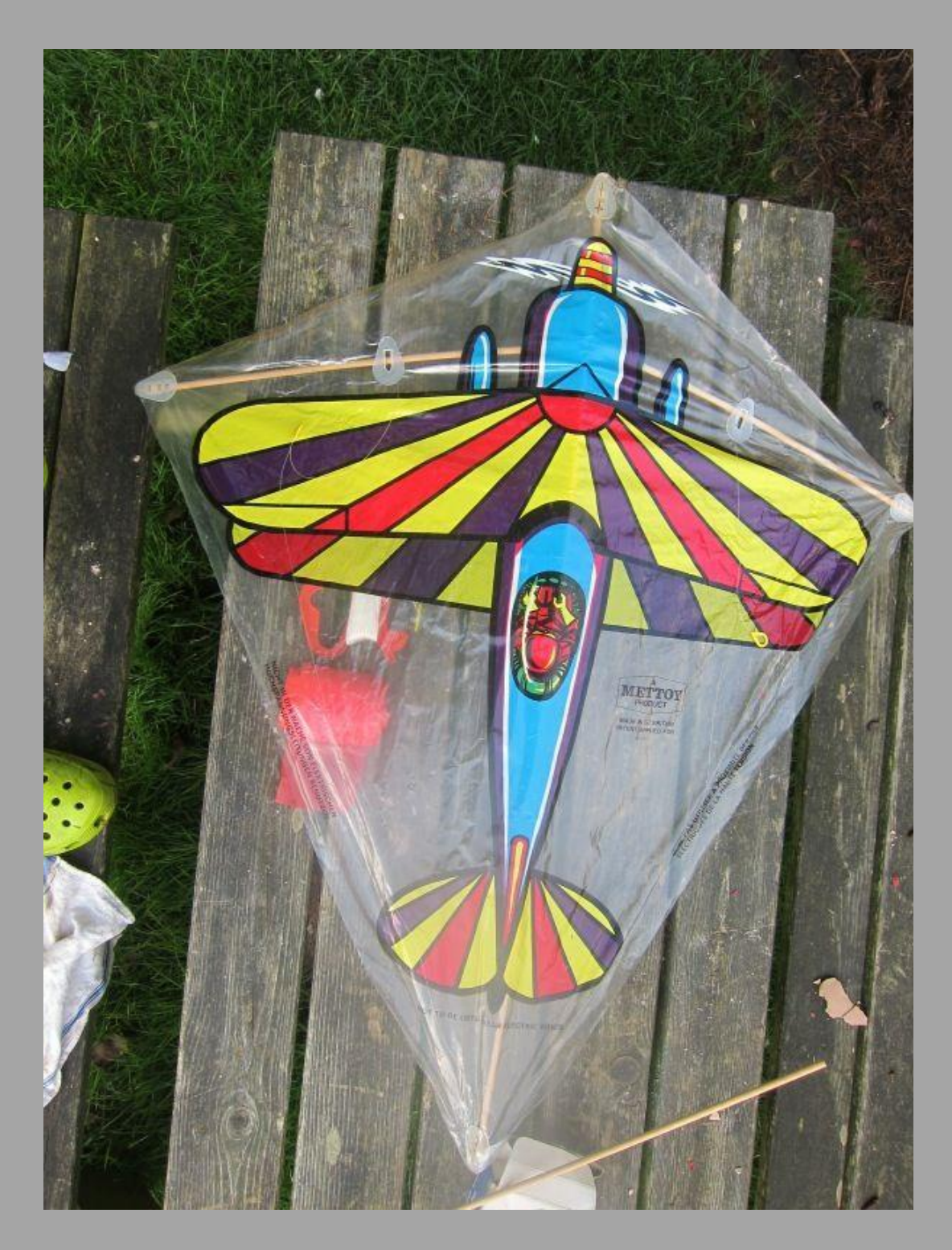
BARNSTORMER STUNT KITE