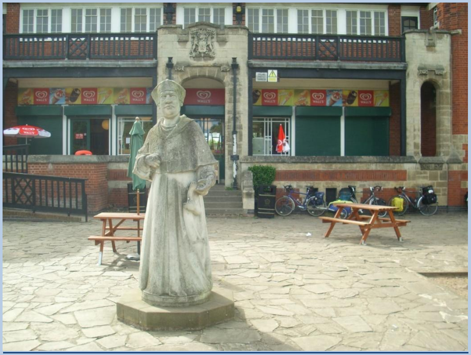
Statue of Cardinal Worsley outside the Abbey Park Café in Leicester