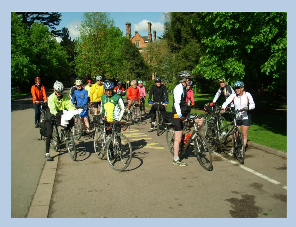
50 Mile Ride