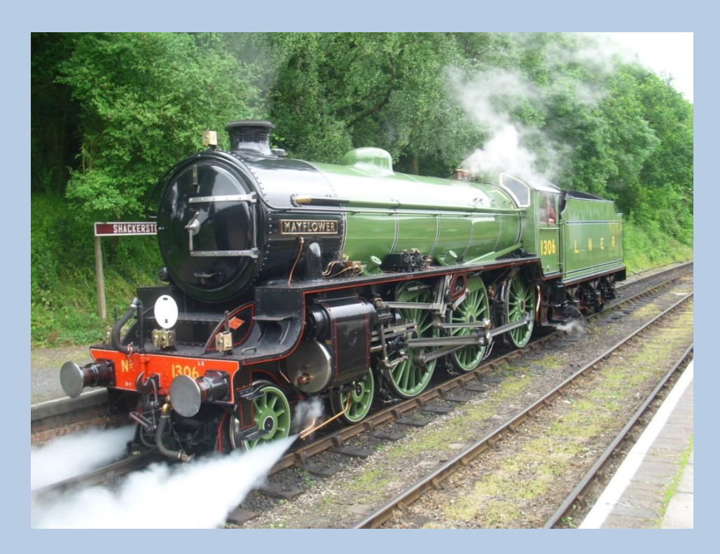
Mayflower on the Battlefield Line.