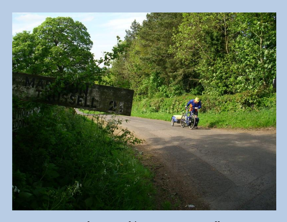
Northamptonshire: Marston Trussell