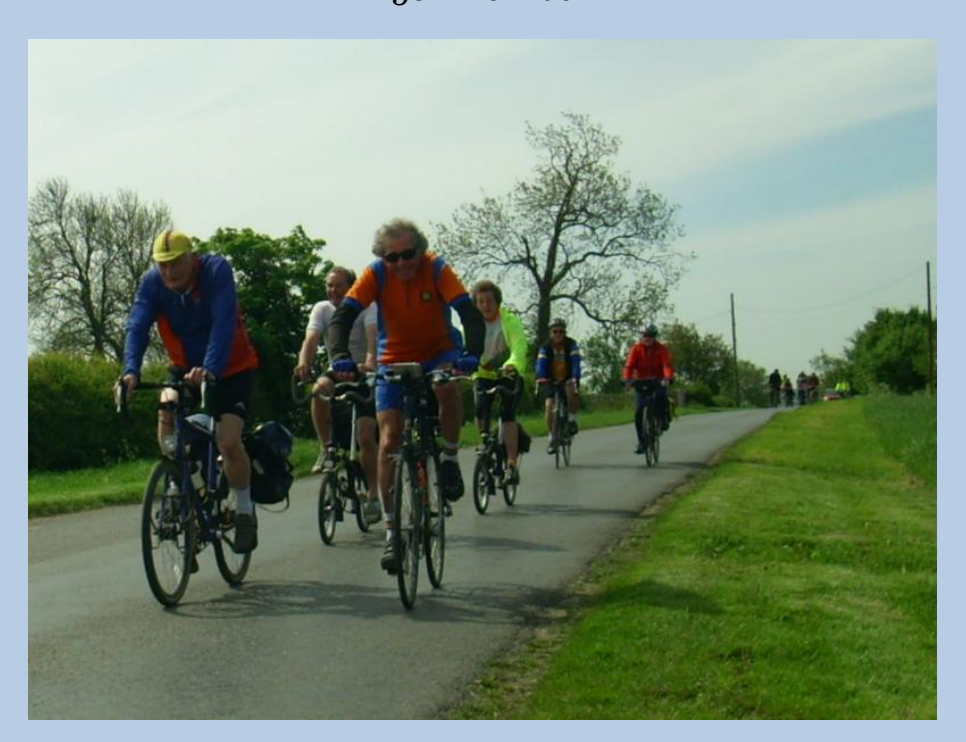
30 Mile Ride