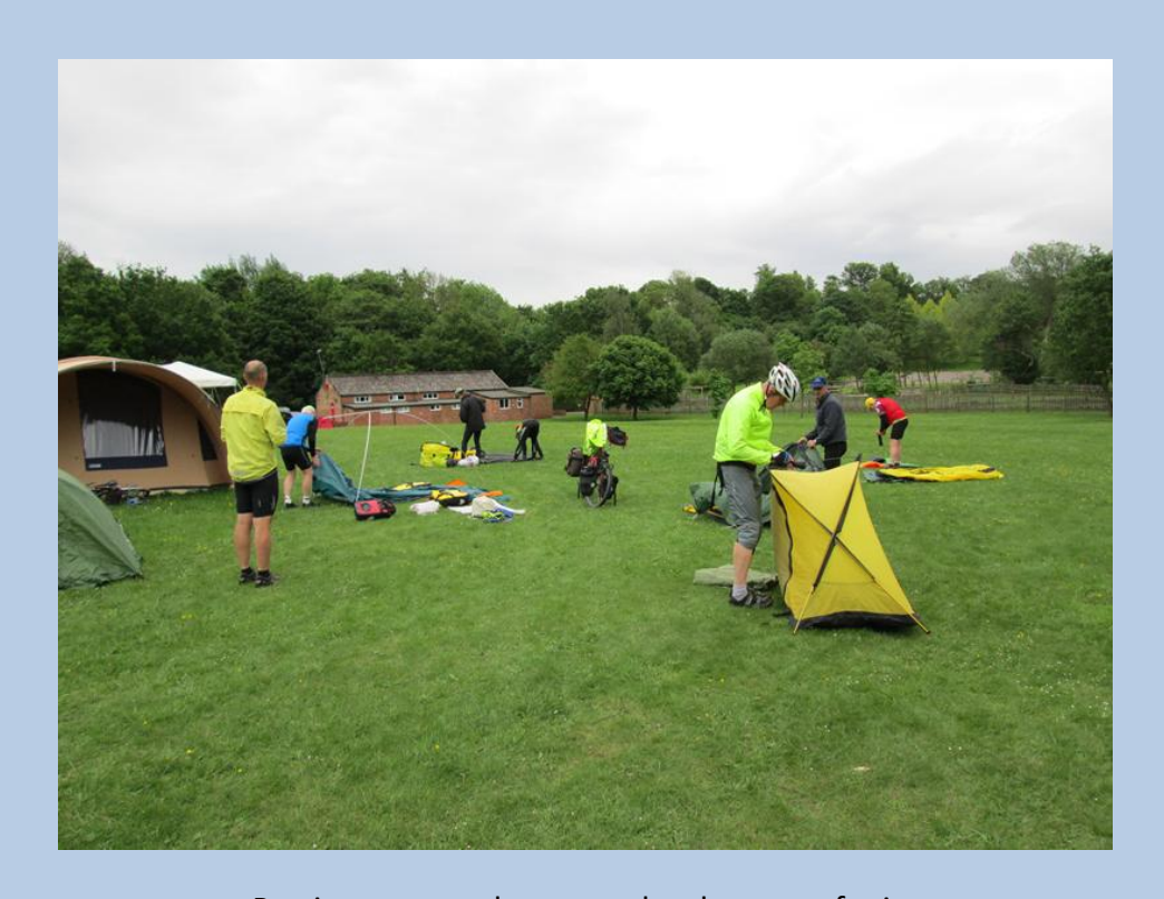
Putting up tents between the showers of rain.