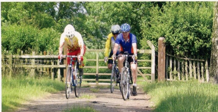
Northamptonshire's gated roads and lanes are quiet and undulating

Our route only skirts the town before passing through the pretty village of Weston Underwood, leaving the river behind at Gayhurst, where the Regency church is worth a small diversion. From Hanslope it is just a short run back to the Salcey Forest café.