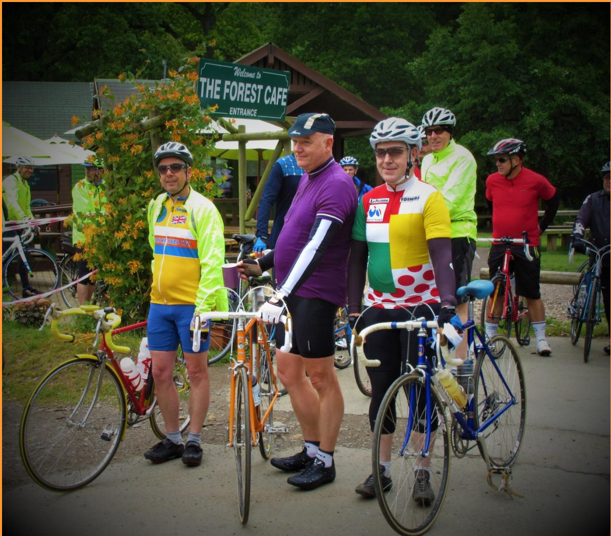
Start of the Retro Veterans Cycles 100KM/Three Counties 100KM from Salcey Forest in 2015