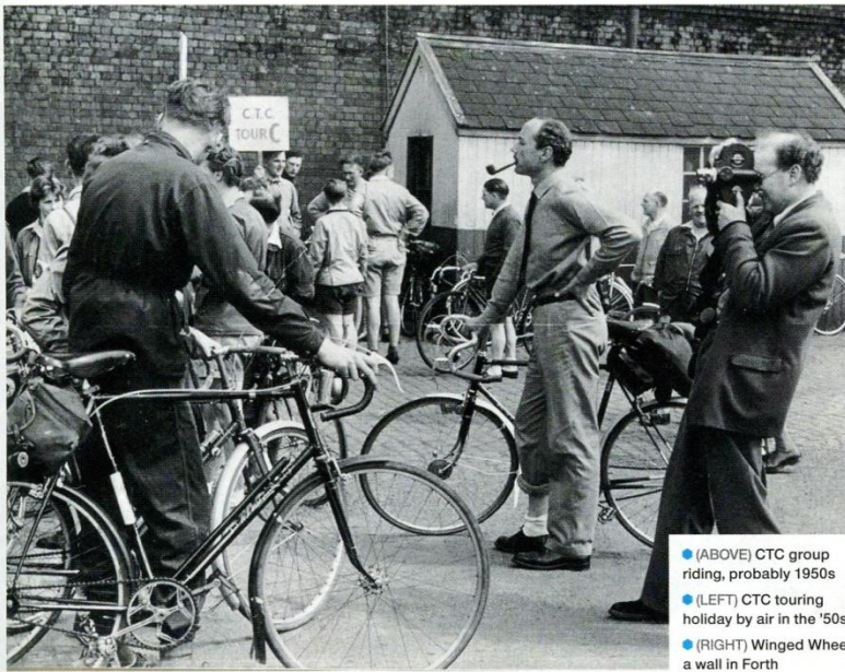
● (ABOVE) CTC group riding, probably 1950s ● (LEFT) CTC touring holiday by air in the '50s ● (RIGHT) Winged Wheel on a wall in Forth