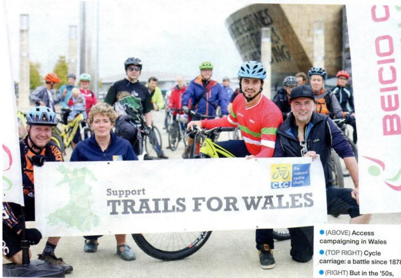
● (ABOVE) Access campaigning in Wales ● (TOP RIGHT) Cycle carriage: a battle since 1878 ● (RIGHT) But in the '50s, cyclists chartered trains!