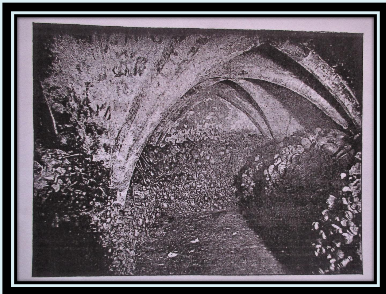
Rothwell Crypt in 1888

After picking Thelma up at Kingsthorpe, we took the Welford Road out of town and then turned right in Brampton. We turned left at the next junction and rode up the hill into Brixworth. Here we pulled off the road for a minute or two for a quick munch and drink. Our route continued through the villages of Scaldwell, Draughton (a small village not much visited) and on to Rothwell where we stopped and sat on the seats near to the church for elevenses. This church has some very old bones and skulls in its crypt.