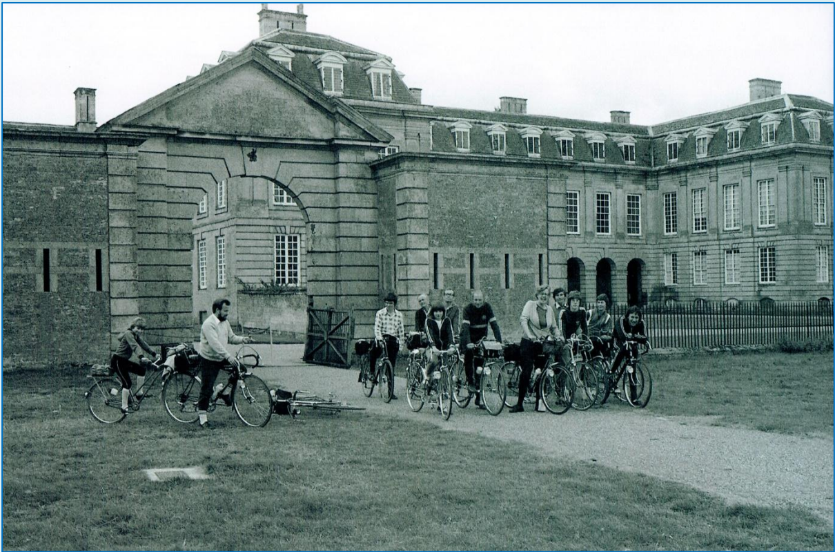
CTC Northampton outside the entrance of Boughton House in 1981, ready to cycle back home.

We came back through Grafton Underwood, Barton Seagrave, Isham and stopped on the green at Orlingbury for a rest and drink. After that, we carried on through Sywell and Overstone to town.